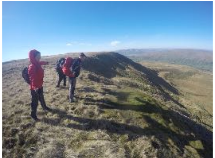
Windy Great Coum Fell May 2017