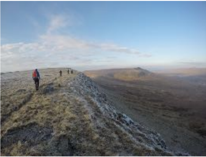
Frosty Swarth Fell January 2017