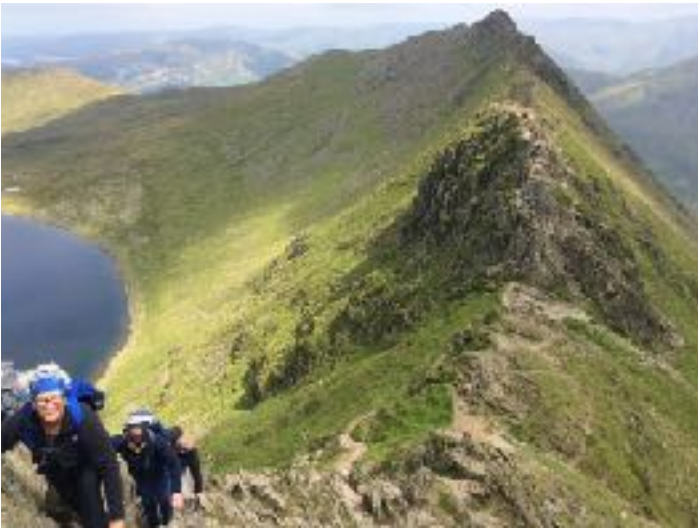
Scary Striding Edge! July 2017