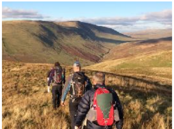
Autumnal Barbon Fells November 2017